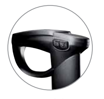
Optional Loop Arm (NL) Black Nylon, with push buttons and soft urethane arm pad.